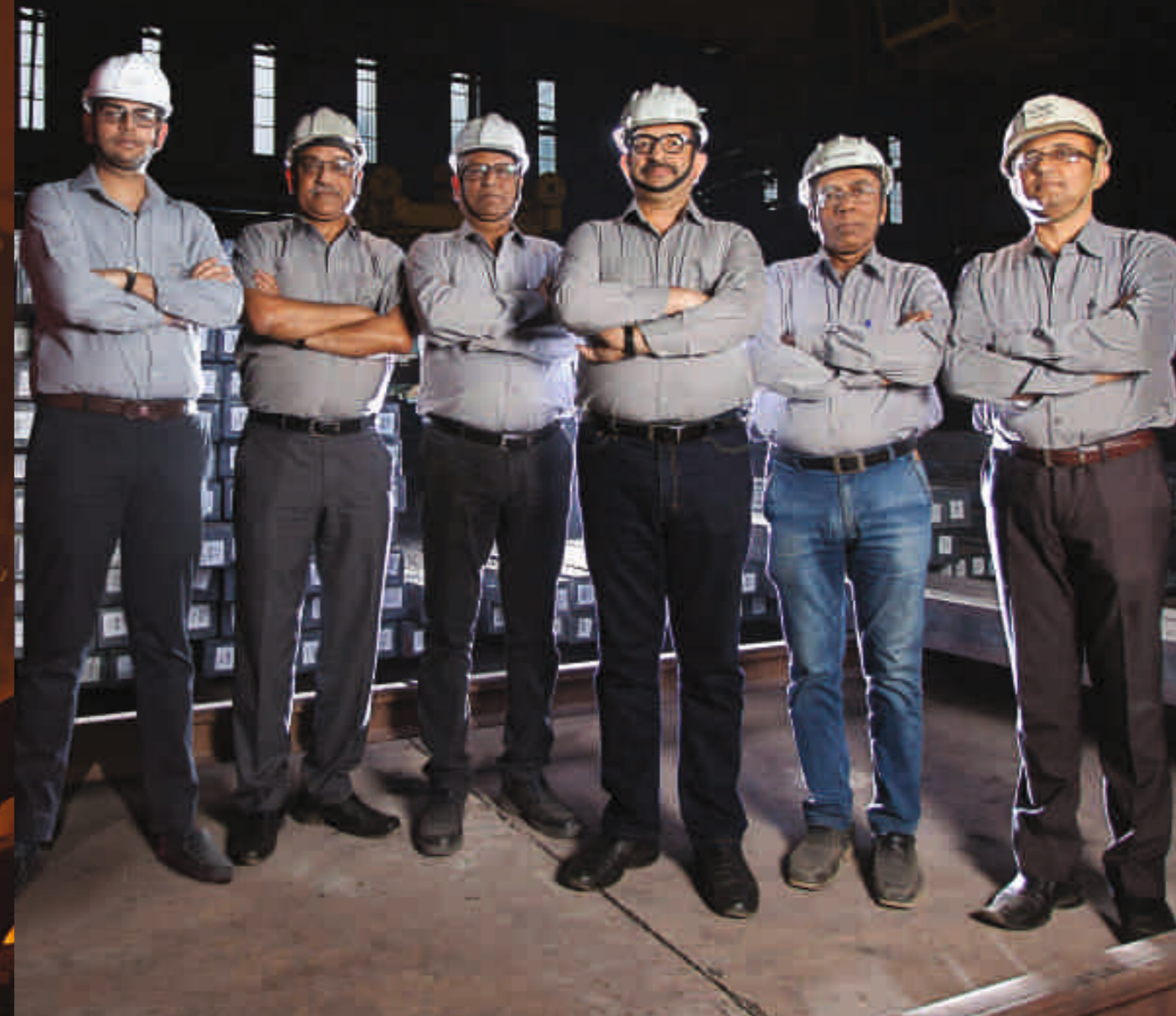
SENIOR MANAGEMENT TEAM

The Management has effectively elicited feedbacks from its employees for enhancing productivity and excellence.